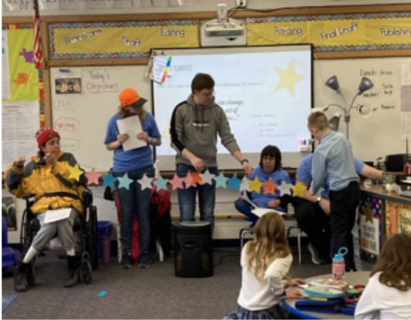
Ambassadors for Respect Training in a 4 th Grade Classroom