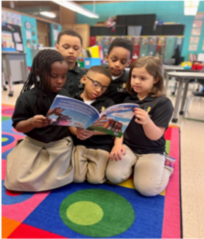
Books for Peacemakers with 1 st Graders at St. Alphonsus