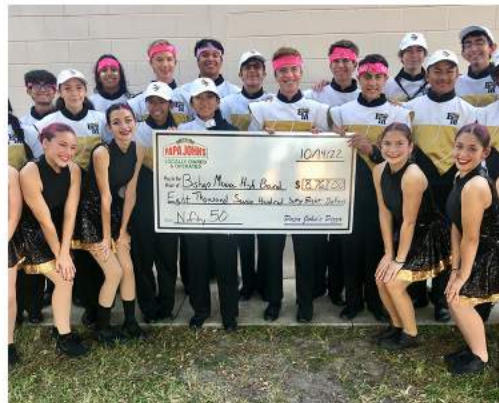
Bishop Moore High School Band - Orlando