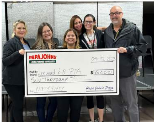
Leewood K-8 School - Miami