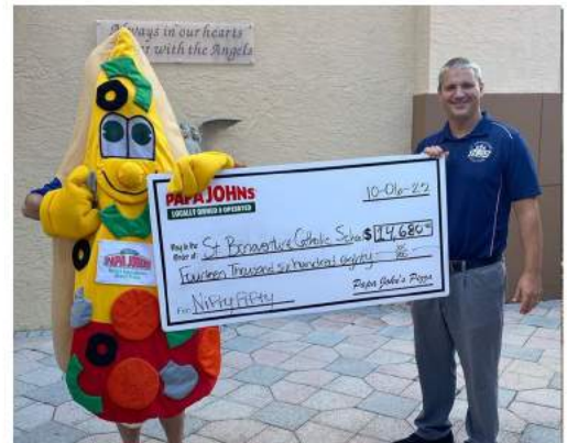
St. Bonaventure School - Davie

No Administration Fees • No Minimum Purchase • $0 Upfront